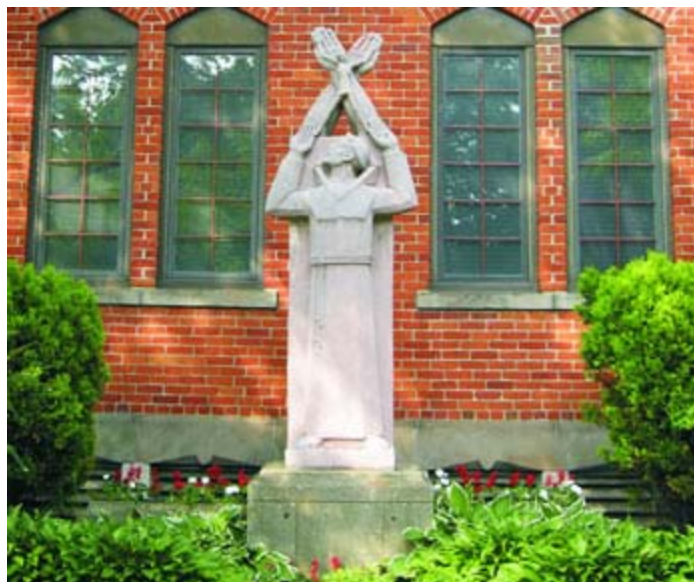
St. Bonaventure on Monastery Mt. Elliott in Detroit is home to St. Bonaventure Fraternity.